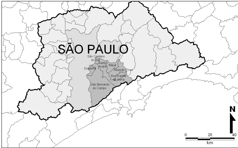
Map 2: The Metropolitan Area of São Paulo. City of São Paulo and the ABC Region in darker colours

seven municipalities: Santo André, São Bernardo do Campo, São Caetano do Sul, Mauá, Diadema, Ribeirão Pires and Rio Grande da Serra.